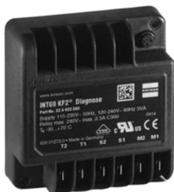
INT69 KF2 Diagnose